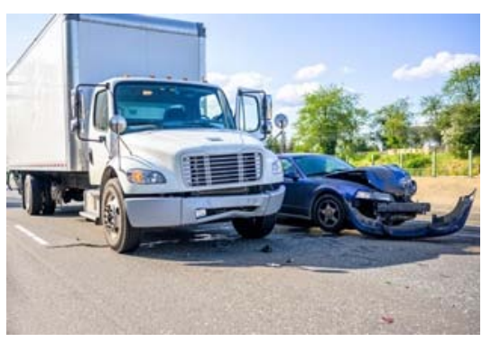
What do I have to do to protect my rights after a truck accident?